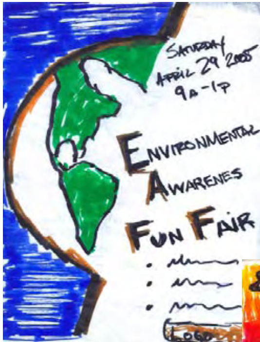
Initial hand drawn comps