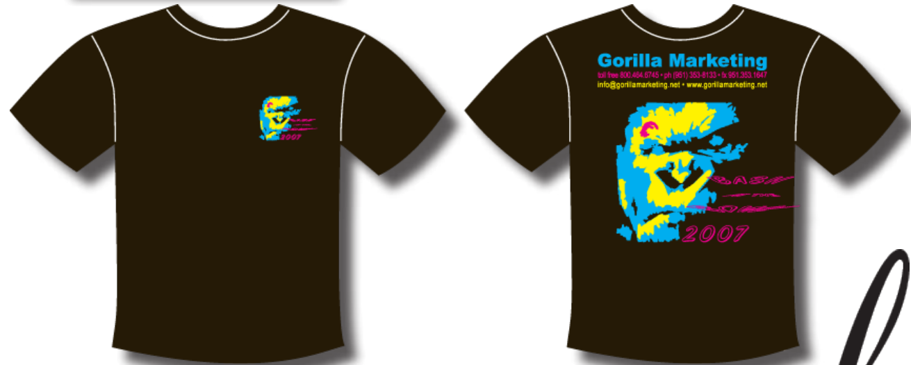
Gorilla Marketing - Logo Design and Placement