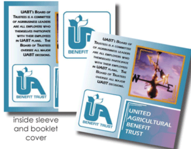
inside sleeve and booklet cover