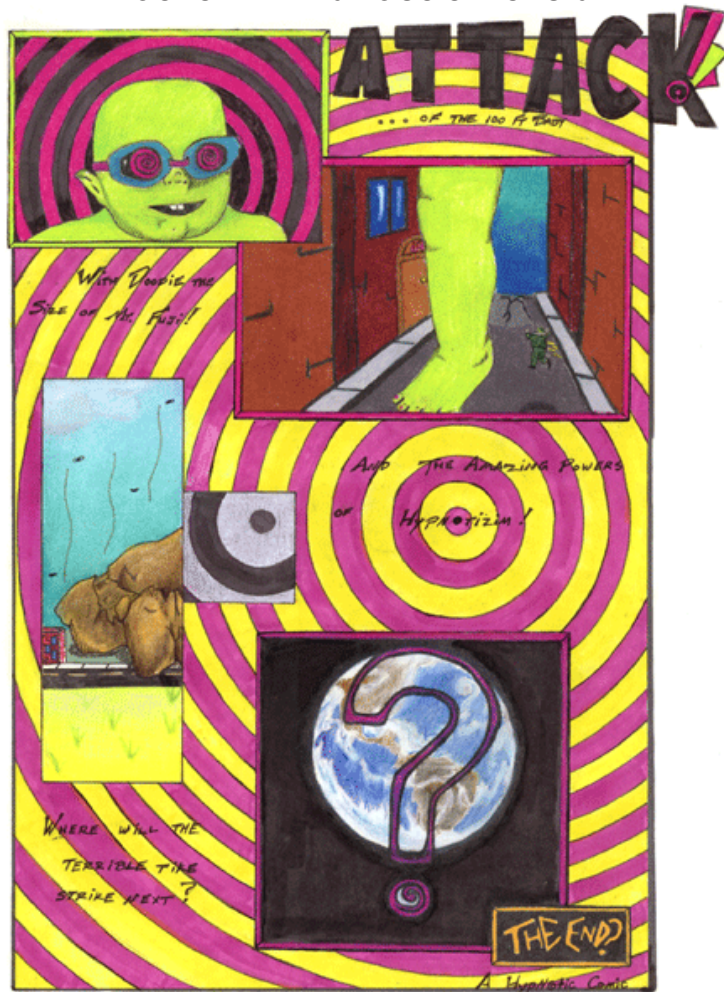
Hand drawn illustration done with Prismacolor Pencils